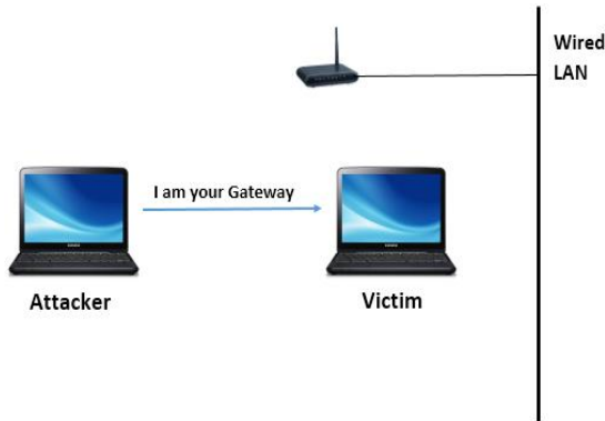
Fig.3. Stealth Man-In-The-Middle attack

information gathered through forged frame sent by the attacker and thus its ARP cache gets poisoned.