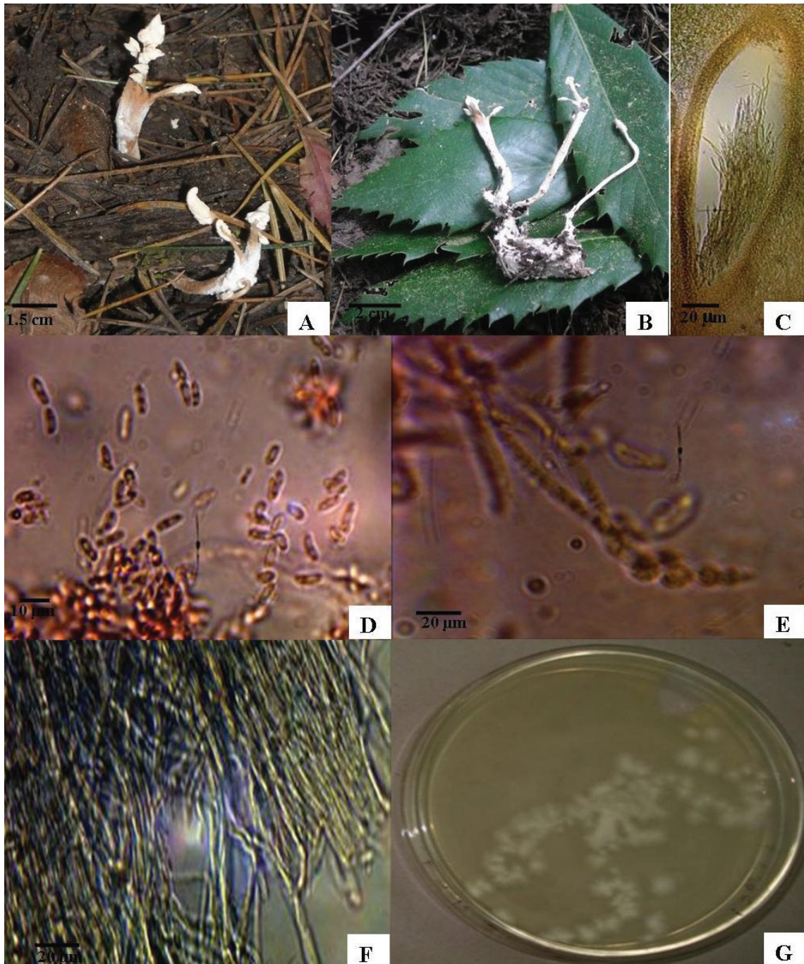
Figure 1. A. M. dhauladharensis in wild habitat, B. Unearthed stromata associated with hymenopteran insect, C. Microphotograph of perithecia, D. Dividing conidia, E. Conidiogenesis, F. Asci, G. Mycelium.

Distribution: This species was found to be distributed at 32.238602°N, 76.323878°E in the Himalayan zone.